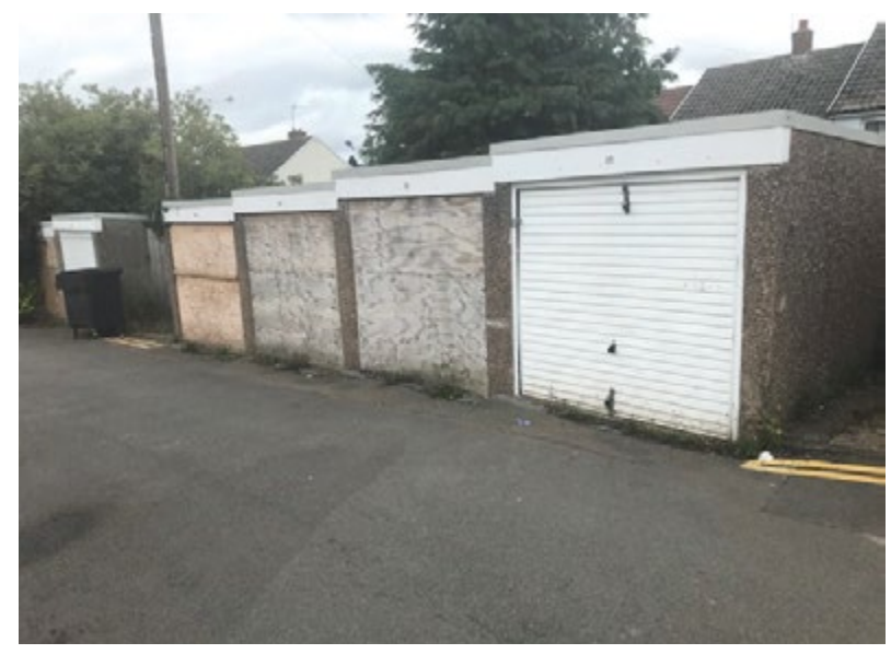
Unused garages had been boarded up creating an unsightly appearance of a derelict and uncared for location. Fly-tipping was a regular problem at the site and the area was rarely used for its intended purpose as a car park.