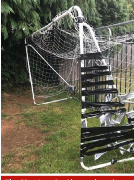
The Play Area had been closed due to vandalism and safety concerns, however some young people still managed to gain entry causing nuisance, litter and further damage. The general impression was of an unsightly, dangerous and uncared for location.